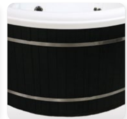
Stainless Steel Banding (only available on round models)