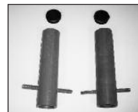
Left Photo: WS-V ANC-BRONZE Right Photo: WS-V ANC-PLAS

CUSTOM POWDER COATED COLORS: White: -1; Black: -2; Earth: -3; Copper Vein: -4; Hammertone Gray: -6; Light Gray: -9 (add custom color code behind part # when ordering)