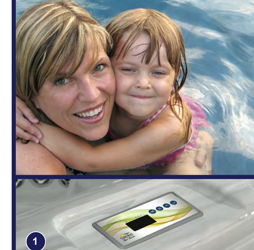
Stereo model shown in Sterling Silver