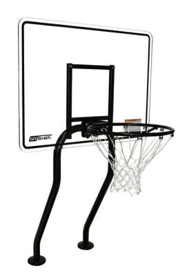
Shown in Salt-Friendly SealedSteel®. (also available in an uncoated model)