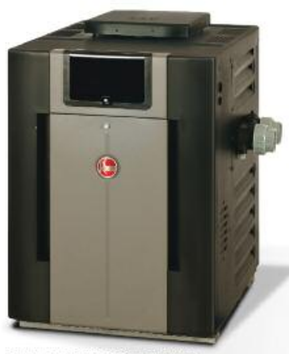
RHEEM LOW NOX DIGITAL POOL & SPA HEATER