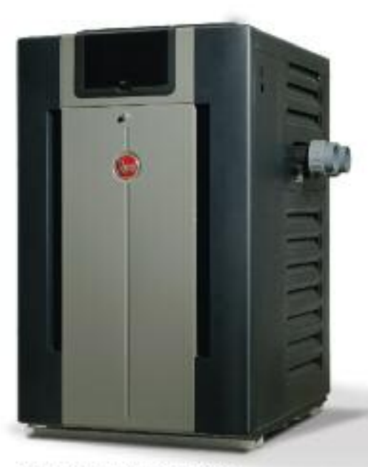
RHEEM DIGITAL POOL & SPA HEATER