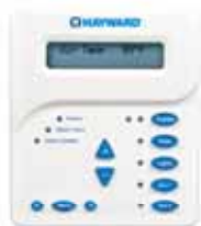
Wired Wall-mount Remote