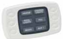
Wired 6-Function Spa-side Remote