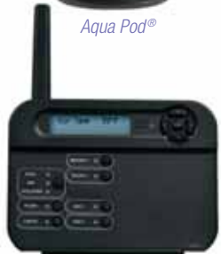
Wireless Tabletop Remote