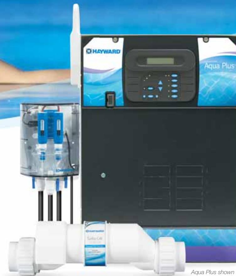
Aqua Plus shown with optional Sense and Dispense.

The Aqua Plus package contains two main parts: an Aqua Plus automation unit and a Turbo Cell®. Here's a simple breakdown of the roles each component plays in making your backyard a relaxing oasis.