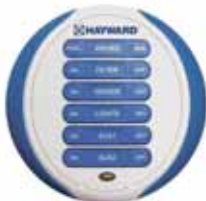
Wireless 6-Function Remote